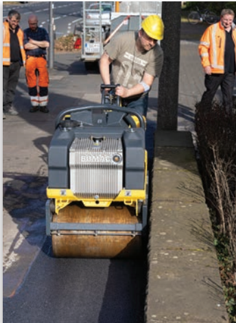
Walk Behind Double Drum Rollers

LOOKING FOR OTHER EQUIPMENT TO GET THE JOB DONE? MCCANN IS HERE TO HELP!