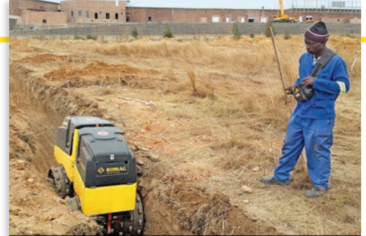
Remote Control Compaction