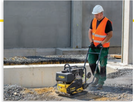
Forward Plate Compactors