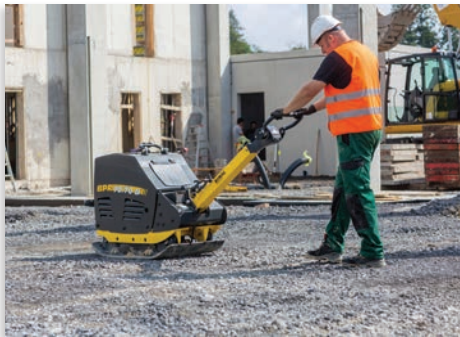
Reversible Plate Compactors