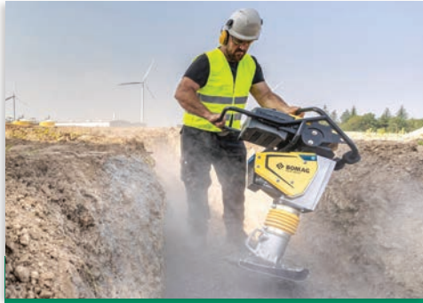
Tampers/ Jumping Jacks